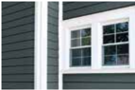
ROYAL® TRIM & MOULDINGS