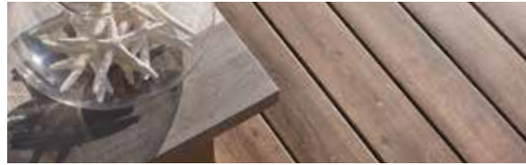
ZURI® PREMIUM DECKING