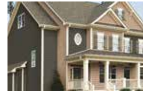
ROYAL® SHUTTERS, MOUNTS & VENTS