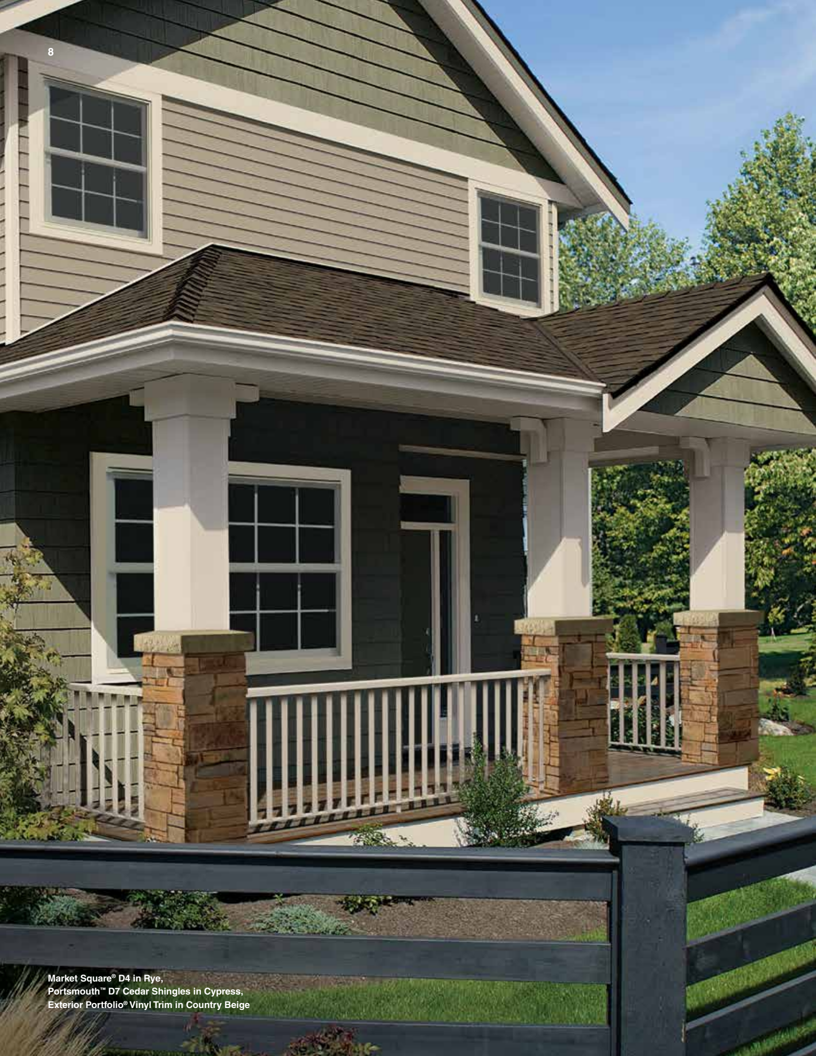
Market Square® D4 in Rye, Portsmouth™ D7 Cedar Shingles in Cypress, Exterior Portfolio® Vinyl Trim in Country Beige