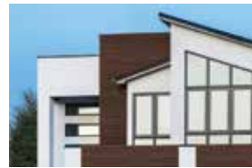
CEDAR RENDITIONS™ ALUMINUM SIDING