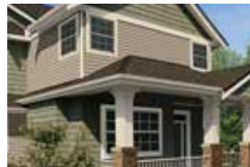
EXTERIOR PORTFOLIO® SIDING