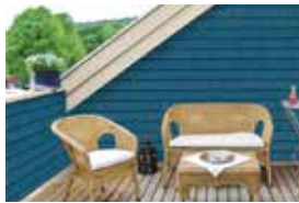
PORTSMOUTH™ SHAKE & SHINGLES