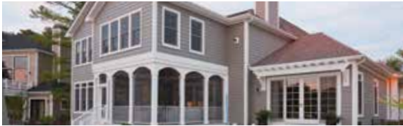
CELECT® CELLULAR COMPOSITE SIDING