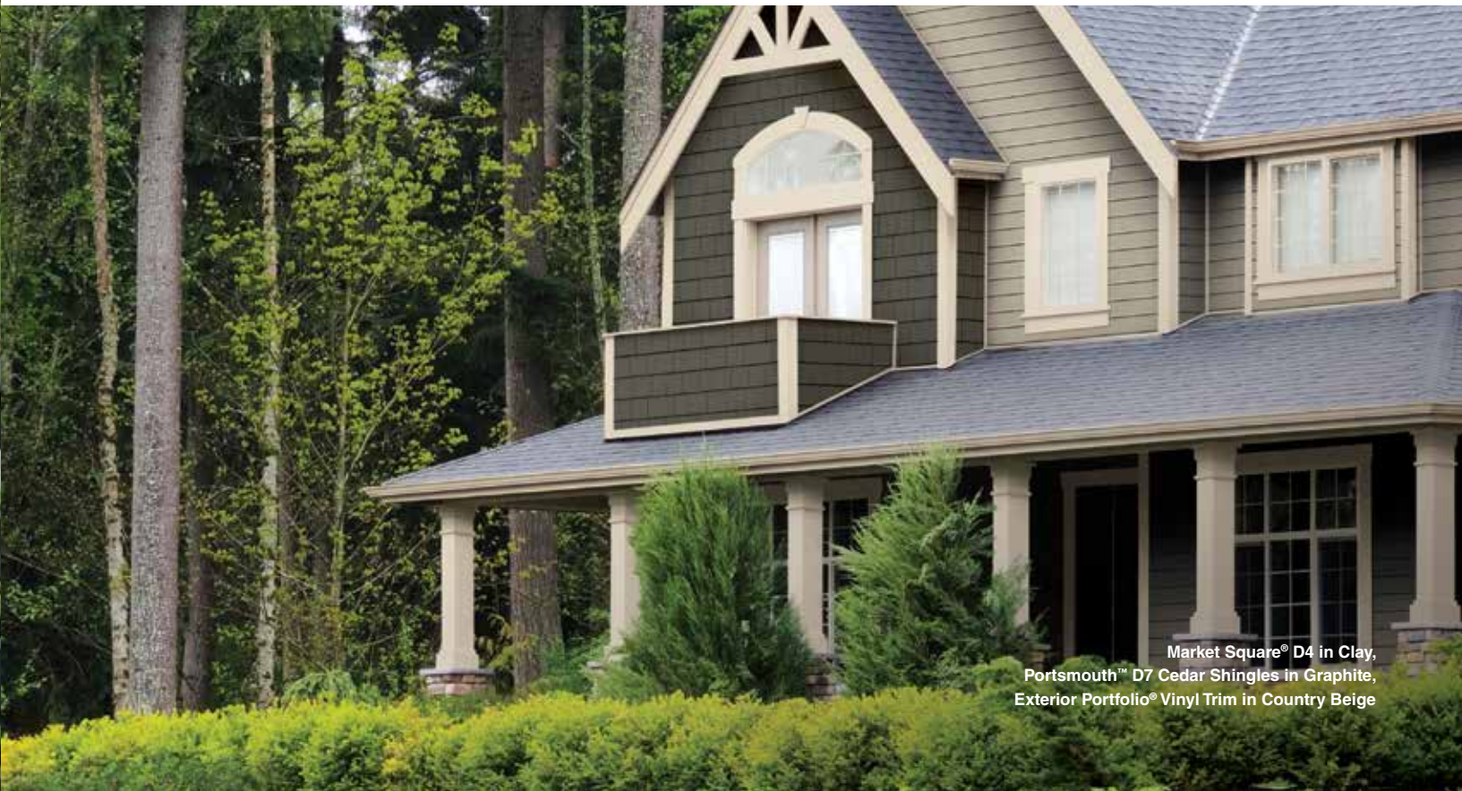
Market Square® D4 in Clay, Portsmouth™ D7 Cedar Shingles in Graphite, Exterior Portfolio® Vinyl Trim in Country Beige