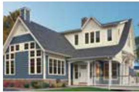
CRANEBOARD® SOLID CORE SIDING®